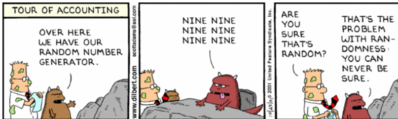
Figure: Dilbert's PRNG (Adams)